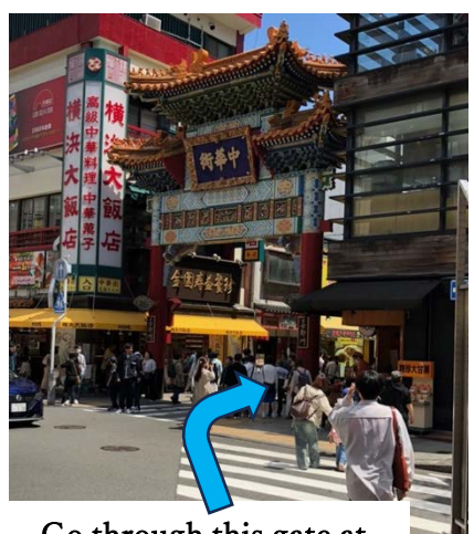
Go through this gate at the five-way intersection.