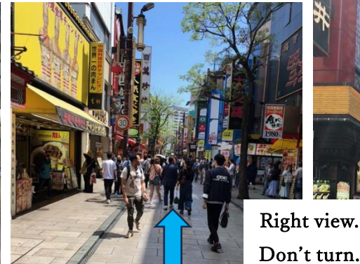
After going through the gate, go straight ahead.